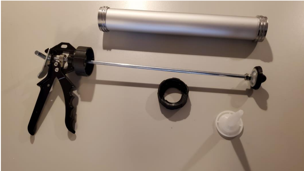
Figure 3: Disassembled Dispenser