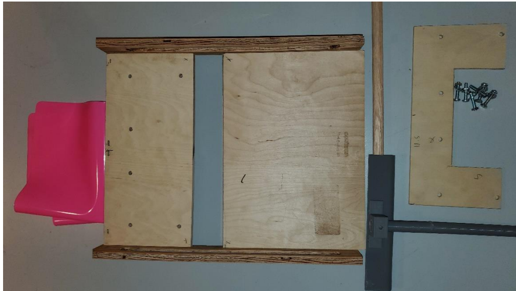
Figure 1: Disassembled Roller