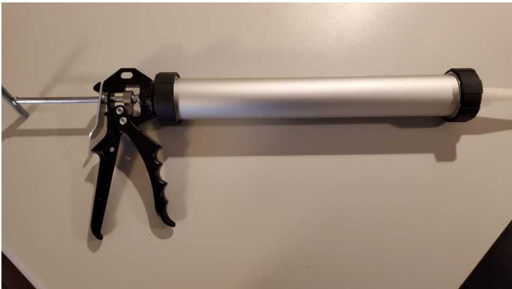
Figure 4: Assembled Dispenser